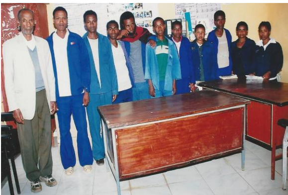
ዳግማዊ ቴዎድሮስ ት/ቤት