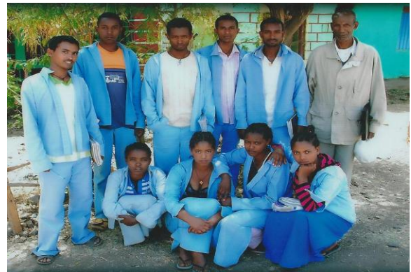
አዲስ ዘመን ት/ቤት