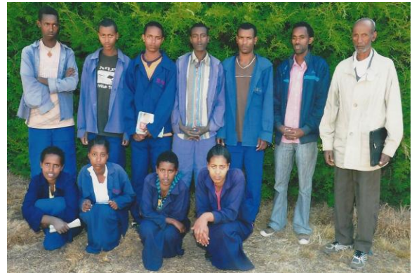
ክምር ድንጋይ ት/ቤት