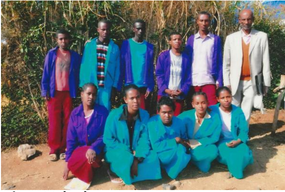
መካነ እየሱስ ት/ቤት